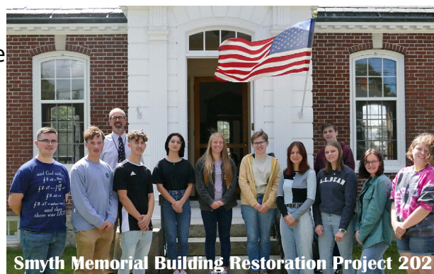
Smyth Memorial Building Restoration Project 2021

The renovation was accomplished in record time, illustrating how big goals can be accomplished when we all work together in a common direction. Local contractors were called upon to prioritize this work in the summer of 2021, with the stated goal of completion by Labor Day. The hard working and generous contractors included Severino Trucking, Patriot HVAC, Pioneer Electric, Ed's Flooring America, Smith Pump among others.